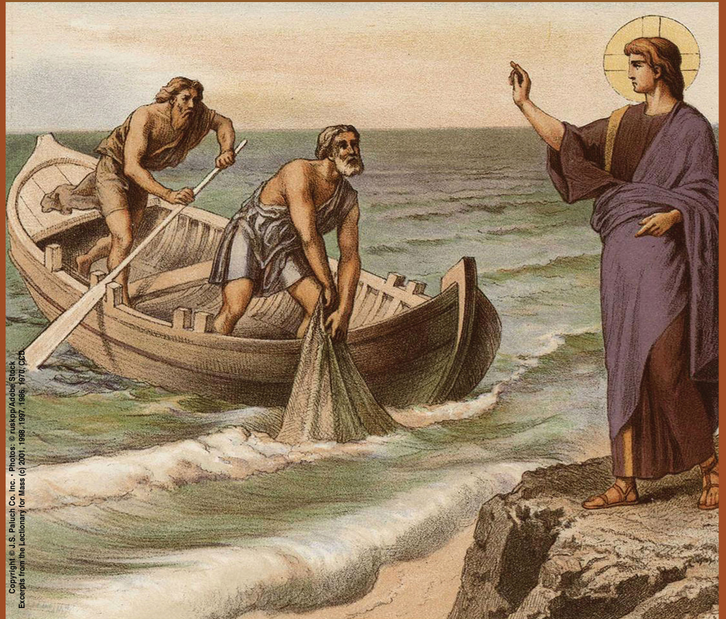
Copyright © U.S. Paluch Co. Inc. Excerpt from the Lectionary for Mass (© 2001, 1988, 1987, 1986, 1971, 1970)